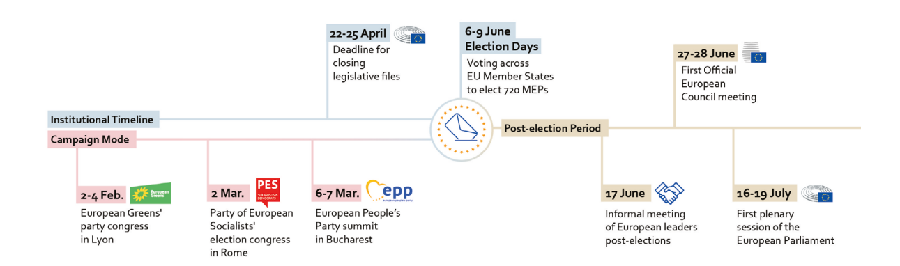
Figure 1: Institutional timeline in the European election year 2024

Regarding the EU budget and support for Ukraine, the EU needs to adjust budget lines to reflect rising costs and unforeseen emergency needs so it can still finance its political priorities until 2027. In addition, Ukraine is dependent on quick support. Leaders will meet in the European Council on 1 February to discuss the 'mid-term revision' of the 2021-2027 Multiannual Financial Framework and a 50 billion Euros financial aid package for Ukraine. Parliament will also have to approve any deal reached at the summit. Also in the pipeline is the reform of the EU's fiscal rules . After months of difficult negotiations, European finance ministers finally found a compromise in December. This agreement still needs to be formally negotiated with the European Parliament, but policymakers are hoping to conclude it quickly. The reform needs to be finalised by July to avert the eventuality that currently suspended fiscal rules that are no longer considered fit for purpose will be reinstated.